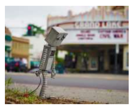
He was very sad. No one wanted a flower.