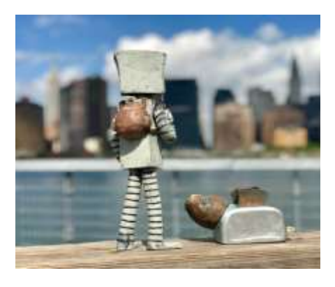
He went on a journey.