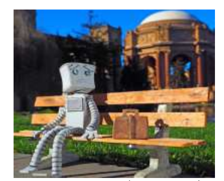
Once upon a tíme a robot called Melvín was sad.