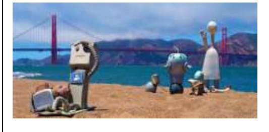
He went to the beach. He lived happily ever after with his robot friends.