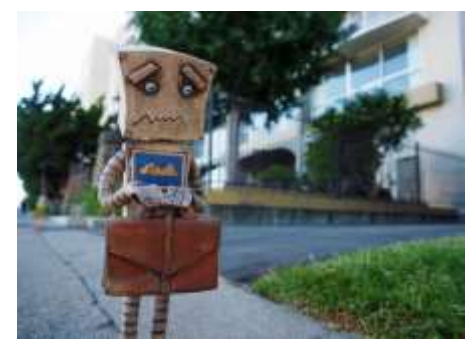
He went outside to get some fresh air.